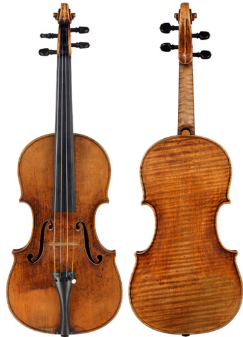
Wieniawski del Gesù