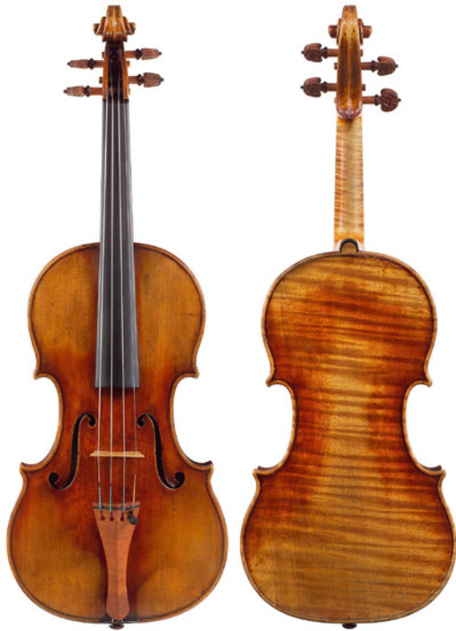
Lady Harmsworth Stradivari