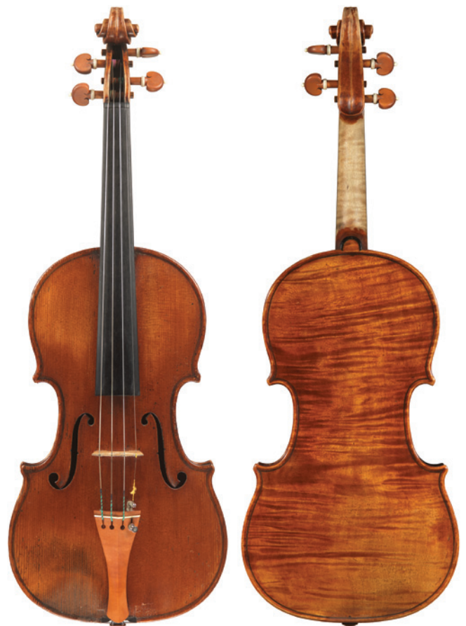
Instrument