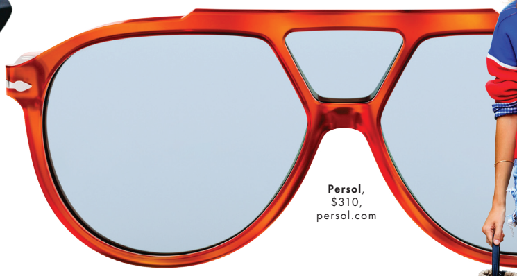
Persol, $310, persol.com